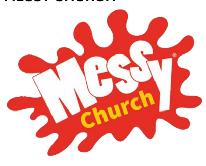
Our January Session will be on January 12, 2025 - 4 to 6 PM