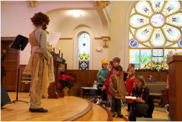
Scripture Reading Interpretation