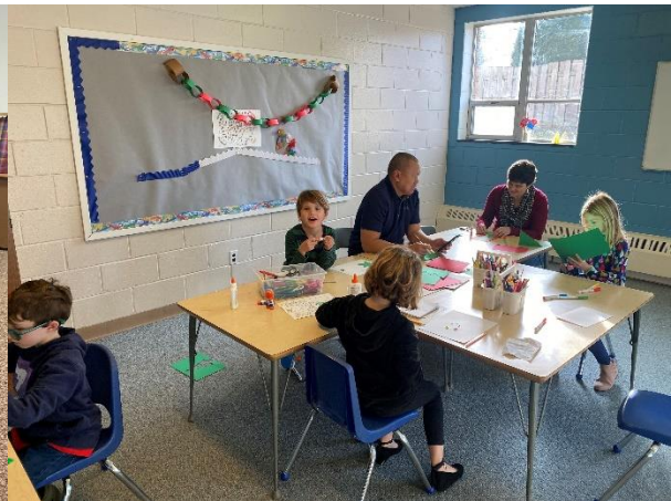
Wondering about the story of Ruth, singing Christmas Carols and making cards.