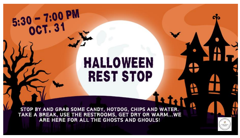
Interested in helping?? Please sign up HERE