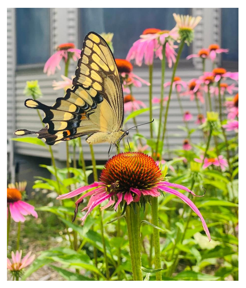
Family Spiritual Practice