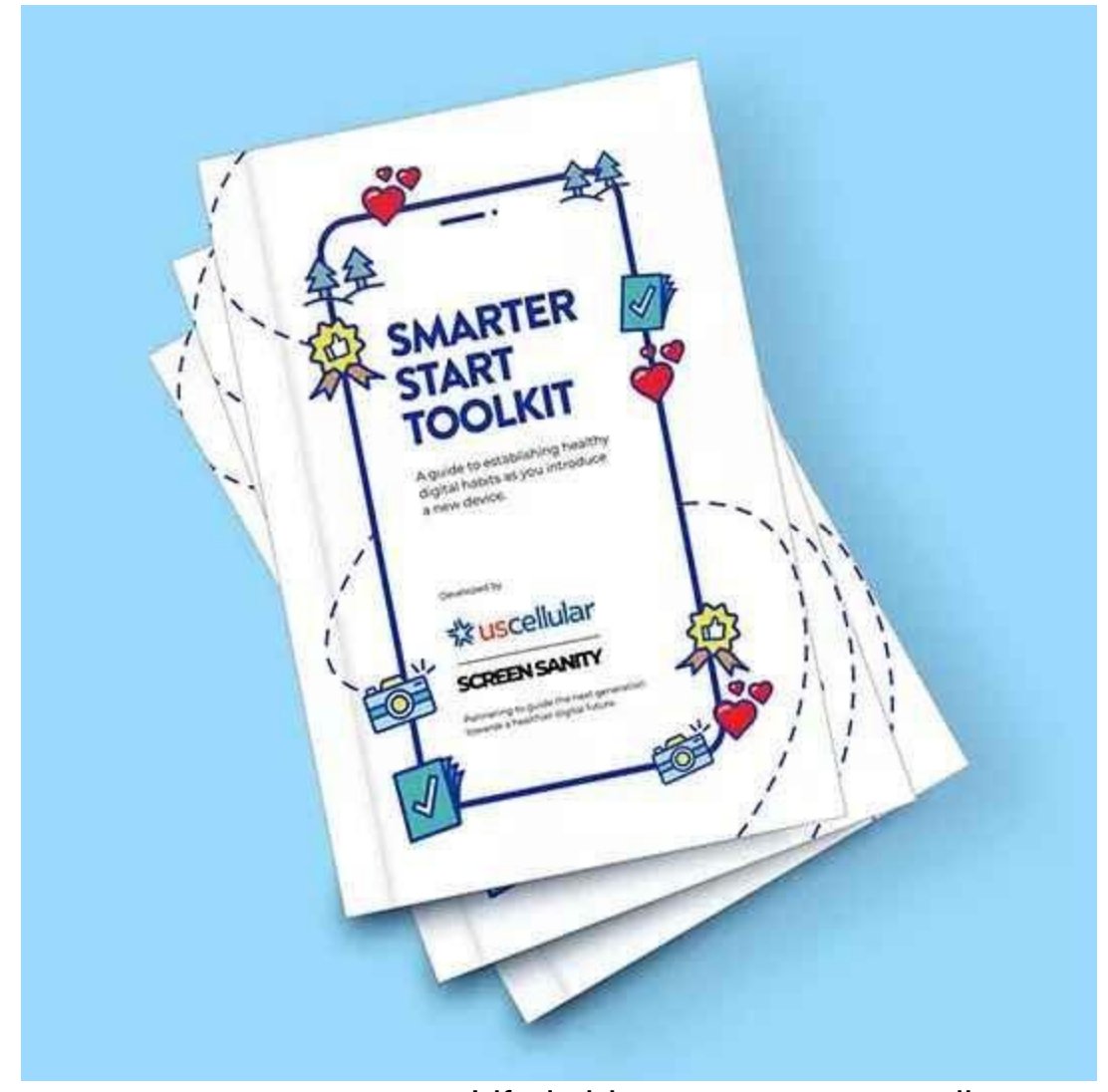
Life is big, screens are small... and you deserve to live your fullest life.

https://screensanity.org/tool/smarterstart/